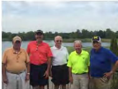
2015 Champions - Sugar Springs Golf Club

Congratulations to the Member's that played: